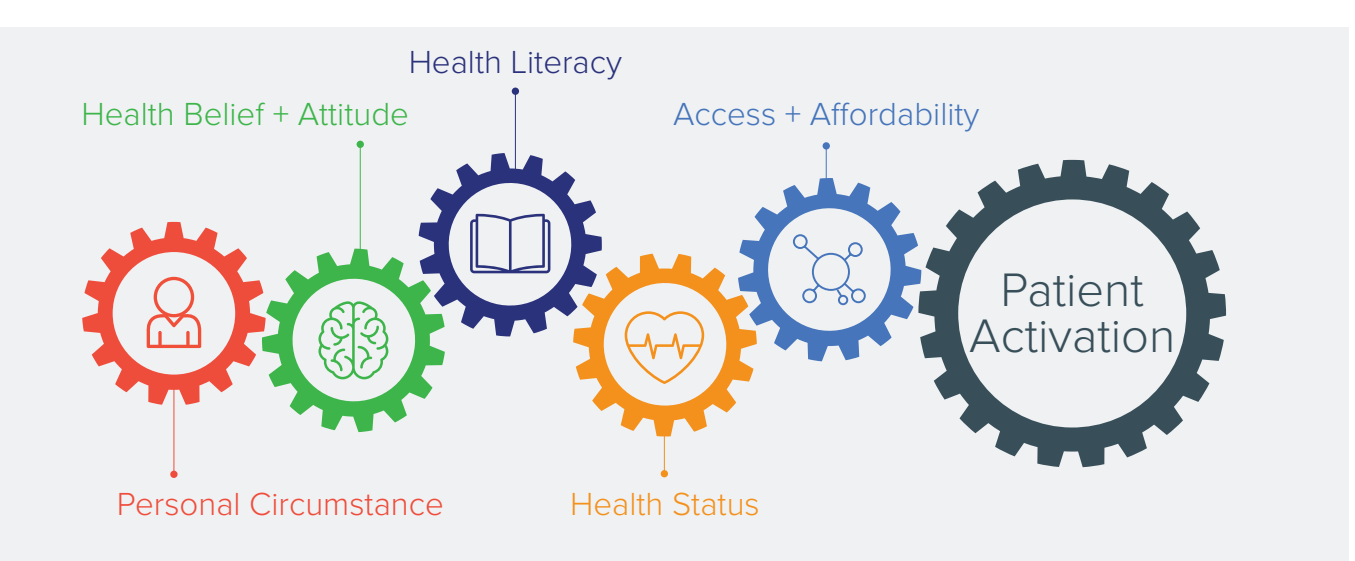
Exhibit 3: The Five Drivers of Patient Activation and Their Definition